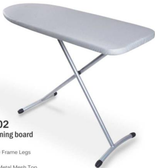
HLIB-102 Full-size ironing board