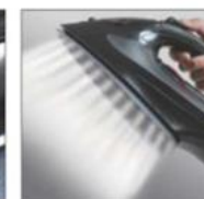
Burst of steam & Spray