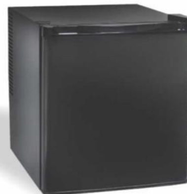
HLMB-400 Hotel room minibar