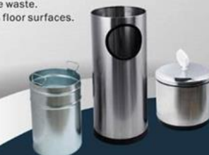
Wipes are dispensed through a sturdy Silicon valve, allowing a single wipe to be dispensed