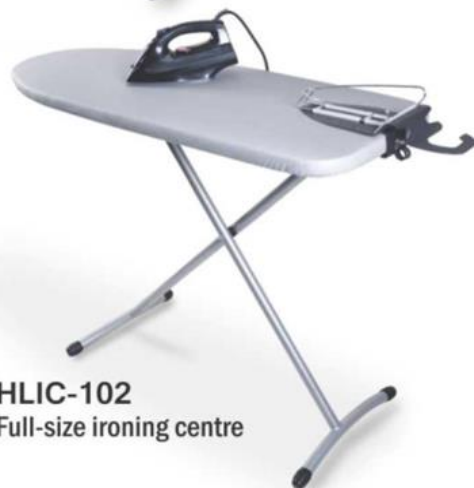
HLIC-102 Full-size ironing centre

Board Dimensions : Open size: 122x40cm Foldable size : 22x42x143cm Maximum Height :87cm