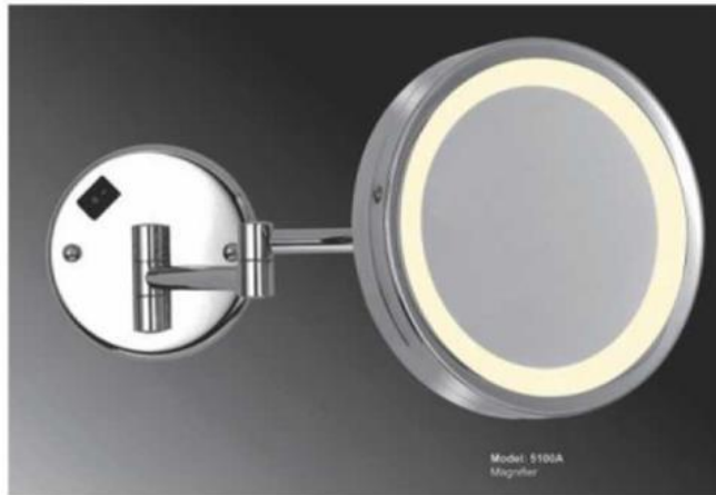
5100A Bathroom mirror, 8"