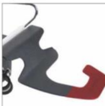
PROTECTION silicone sleeve