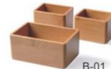
B-02 size: 6.8x5.2x4.7cm B-01 size: 10.4x6.8x4.7cm