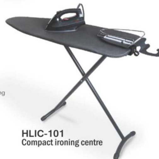
HLIC-101 Compact ironing centre

Board Dimensions : Open size: 110x33cm Foldable size : 20x33x123cm Maximum Height :76cm