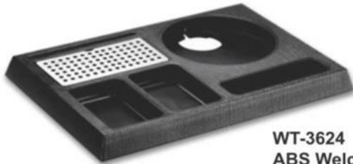
WT-3624 ABS Welcome tray