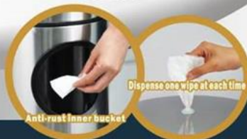
Anti-rust inner bucket