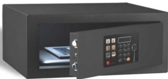
HLRS-121 Hotel room safe

length x height x width: 43 x 20 x 37 cm