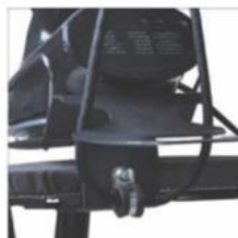
ANTI-THEFT Cable Lock