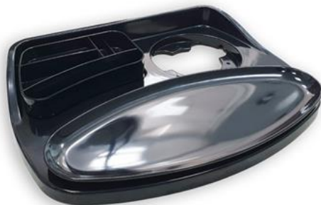
WT- Melamine Welcome Tray