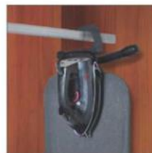
STORES NEATLY ON Rail