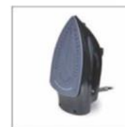
Off 8 minis lock