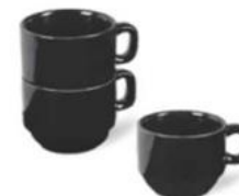
C-02B Coffee cup: 250ml, black and brow