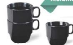
C-03B Coffee cup: 250ml, black and brow