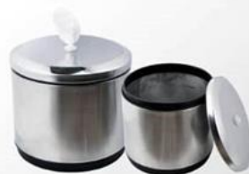
The top bucket can be used separately from the base