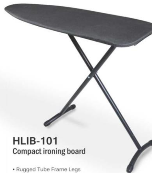
HLIB-101 Compact ironing board