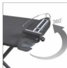
SWIVEL Iron Holster