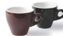
C-01B Coffee cup: 250ml, black and brow