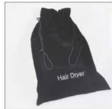
Luxury black velvet bag