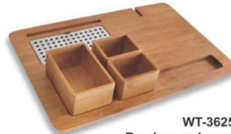
WT-3625 Bamboo welcome Tray